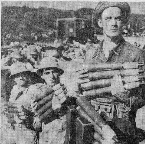
Los Estados Unidos están preparando ya planes para el día en que los soldados sean licenciados.

WASHINGTON.— La Conferencia para el Reajuste del Personal Civil y Militar en la postguerra ha presentado un plan al presidente Roosevelt, con seis puntos fundamentales, contenido en un extenso informe, de veinticinco mil palabras, para poner en pie de paz, después de la victoria, los hombres y las mujeres que forman parte ahora de las fuerzas armadas de los Estados Unidos.