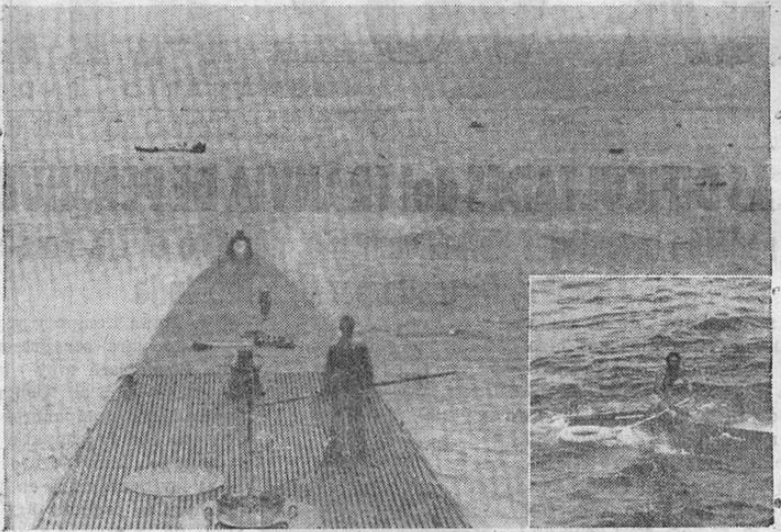
Los submarinos de los Estados Unidos han destruido numerosos barcos mercantes japoneses en el Océano Pacífico. En esta fotografía aparece uno de esos sumergibles en acción. Sobre cubierta se ve un marino con un bichero, preparado para socorrer a los naufragos. En el ángulo inferior de la derecha, vemos a un japonés, en un bote salvavidas, pidiendo auxilio a los tripulantes del submarino victorioso.