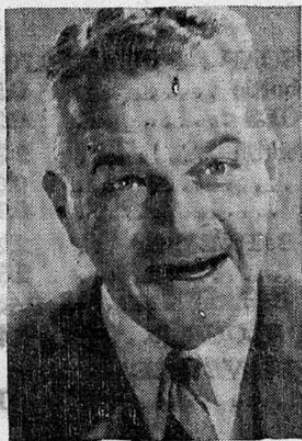
E. S. F. 40-V

Constipation is not contagious, it is caused by the greasy foods which irritate your intestines.